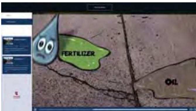
Journey of a Raindrop interactive

This segment features short stories in HD video format, photo galleries, and interactive 360-degree immersive panoramas that bring to life the river's natural and cultural history.