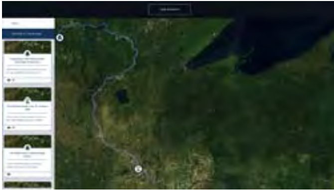
Interactive map interface